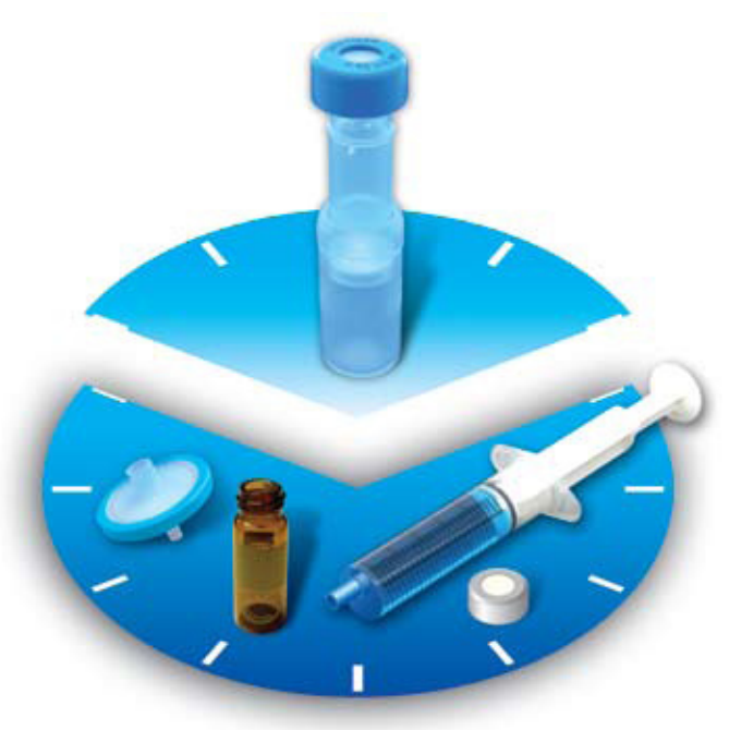
Fig 2. 3 times faster sample preparation combined with reduced solvent usage.